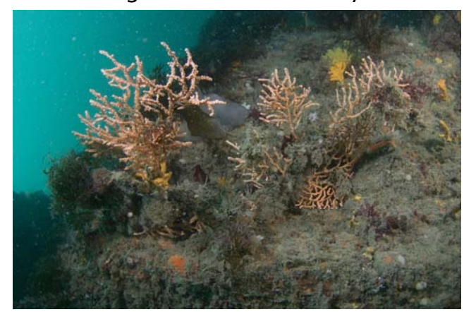
Fouled sea fan

Most of the Eunicella verrucosa were large and healthy but there were some with extensive fouling most likely a natural ageing process - and these do in any case provide an extra habitat for other species particularly sea squirts and bryozoans. The patches of Leptopsammia pruvoti were large and healthy with many iuvenile recruits. Two large burrowing anemones