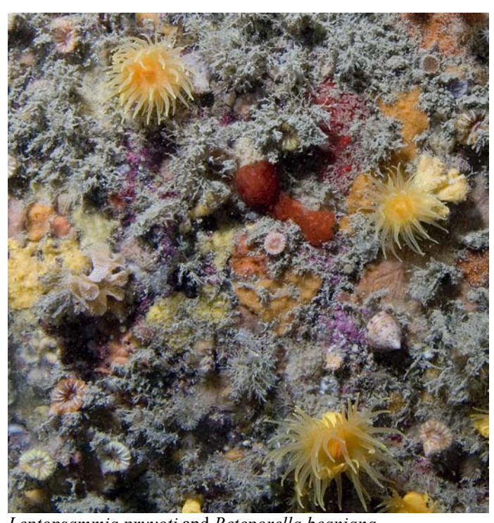
Leptopsammia pruvoti and Reteporella beaniana

This site to the south west of Little Sark had not been dived by Seasearch before. It consisted of large steep sided gullies dominated by Alcvonium alomeratum, sponges such Pachymatisma johnstonia, vellow cluster anemones Parazoanthus axinellae. some Eunicella verrucosa and a large patch Leptopsammia pruvoti. Amongst these there was a single growth of the rare lace bryozoan Reteporella beaniana shown centre left on the photograph.