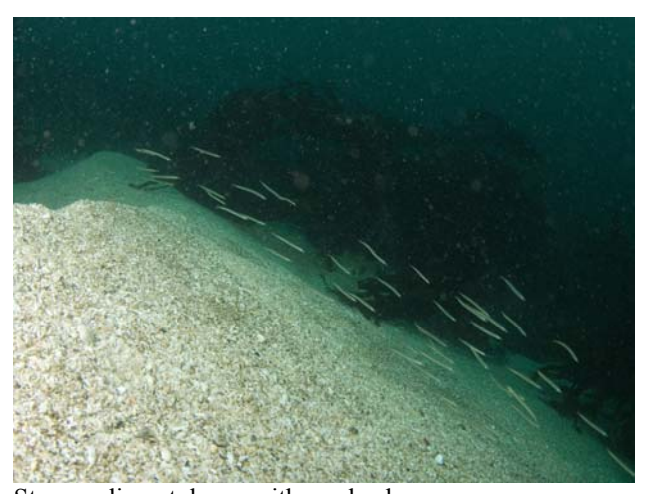
Steep sediment dunes with sand eels Sally Sharrock

This site was a totally different topography from any of the other sites. A series of rock outcrops formed reef areas with kelp cover from 15 to 20m below sea level and were surrounded by coarse sand and gravel dunes with large sand waves several meters high in places. The